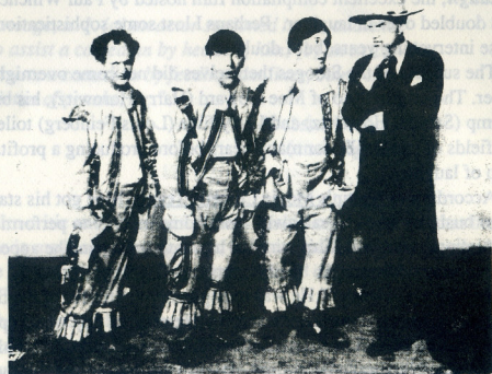
TED HEALY and his three Southern Gentlemen

The team of Ted Healy and his Stooges did well in vaudeville and appeared in several Broadway revues, such as the legendary "Earl